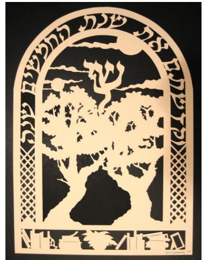
Large (10"x13") $620