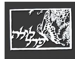
Small (4"x3") $150