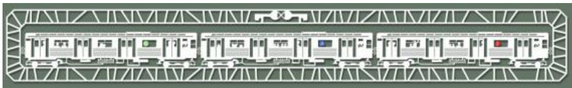
Colossal, painted papercut (5"x30") $900

See http://artistapril.com/papercuts for more samples! >>