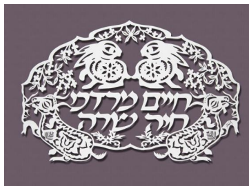
Medium (8"x10") $400