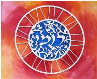
Regular, painted background (8"x8") $350